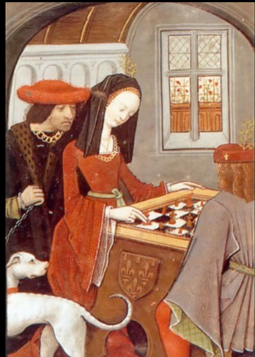
Marguerite of Navarre