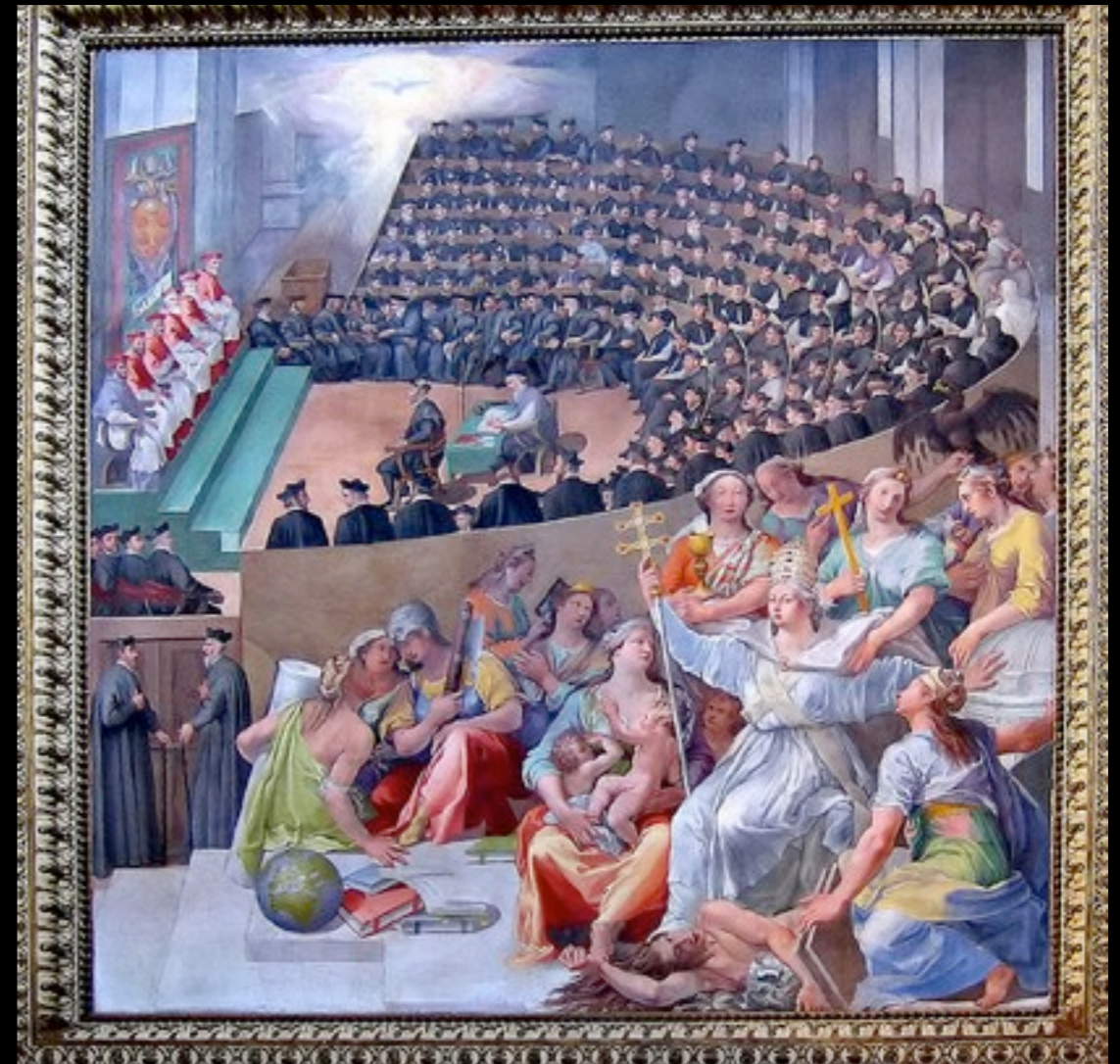
Council of Trent